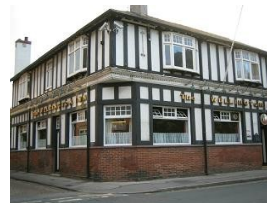
Wellington Inn Hull Pub of the Year 2008